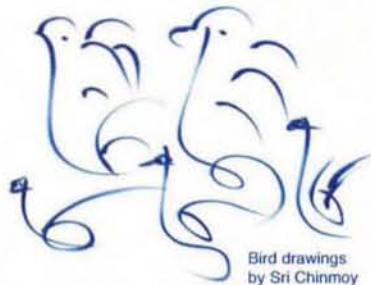
Bird drawings by Sri Chinmoy

The Singers from Sri Chinmoy: The Peace Meditation at the United Nations have been privileged to perform at the UN and other venues, songs composed by Sri Chinmoy dedicated to peace and the UN. At the invitation of UN Secretary-General U Thant, in 1970, Sri Chinmoy began leading meditations for delegates and staff and other programmes for peace at UN Headquarters, and the Singers are honoured to continue in this spirit.